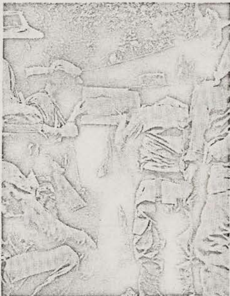
ANTI-CASTRO FORCES TRAIN IN SWAMPS. Small commando raids are effective.

A ND one doesn't have to look far in Cuban exile circles to hear numerous complaints of CIA helplessness in maintaining operations.